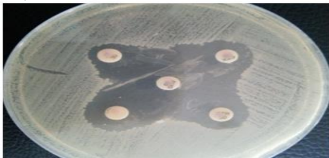
figure (1).Clearance the inhibition of producing of ESBLs due to clavunic acid through expansion of the zone of inhibition between AUG and each of CRO ,CAZ ,ATM and CTX.

The study revealed that E.coli was the most prevalent ESBL producing isolates 65.4%. This result closed to Al-Nammi (2001) in Baghdad (Iraq), who reported that (72.6%) of E. coli isolates gave positive ESBLs, while ESBLs producing K.pneumoniae represent 19.2% in present study this near from local study showed 10.5 % done by Al-Charrakh , (2005). Such result was less than the study in Erbil province 40 % by Ahmad and Ali,(2014).