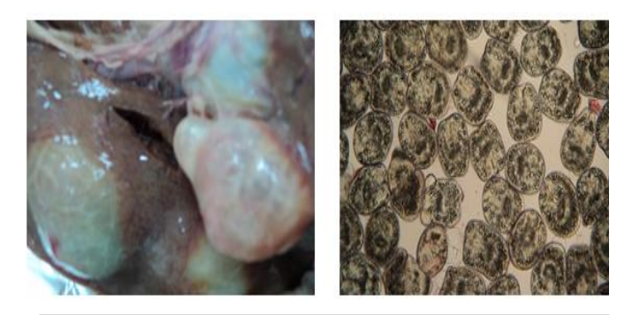
Hydatid cyst with isolated protoscolices

225 male of Mus musculus mice Balb\C strain were injected with 0.2 ml 480/ ml (2400/5ml rate of viability) of protoscolices intraperitoneally and consider as positive group and left for six months.