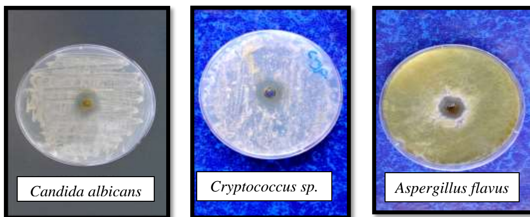
Fig-3-Antifungal activity of Cuminum cyminum extracted oil.