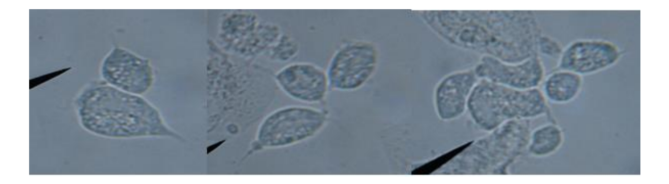
Figure (2) : Trichomonas vaginalis in vaginal discharge and culture